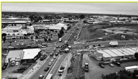
Improvements to the intersection of Main South Road, Carmen Road and Shands Road in Christchurch, including road widening and the installation of a new traffic signal system, will reduce traffic delays and improve safety.

* These figures are likely to increase as additional projects are approved during the year.