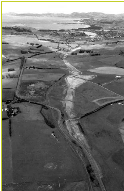
The realignment of SH 1 between the Tumai overbridge and the town of Waikouaiti, to bypass a set of tight curves, will improve safety on this section of highway.

The $16.48 million includes additional road policing resource for the 2006/07 year of 0.3 FTE for crash attendance and investigation.