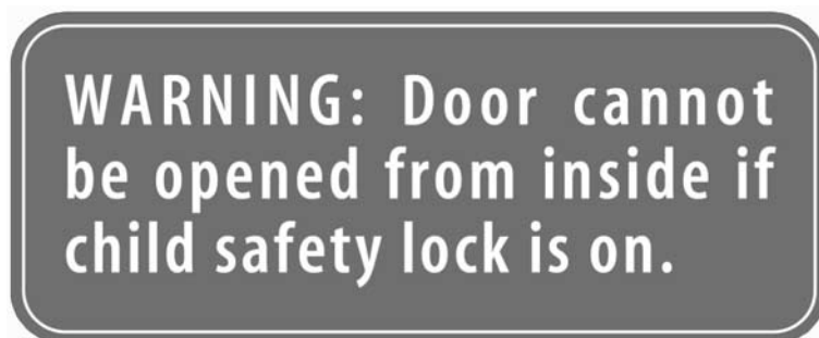
Figure 6-2-2. Approved child safety lock sign

Small passenger service vehicle means a vehicle used for use in a passenger service for the carriage of passengers that is designed or adapted to carry 12 or fewer persons (including the driver).